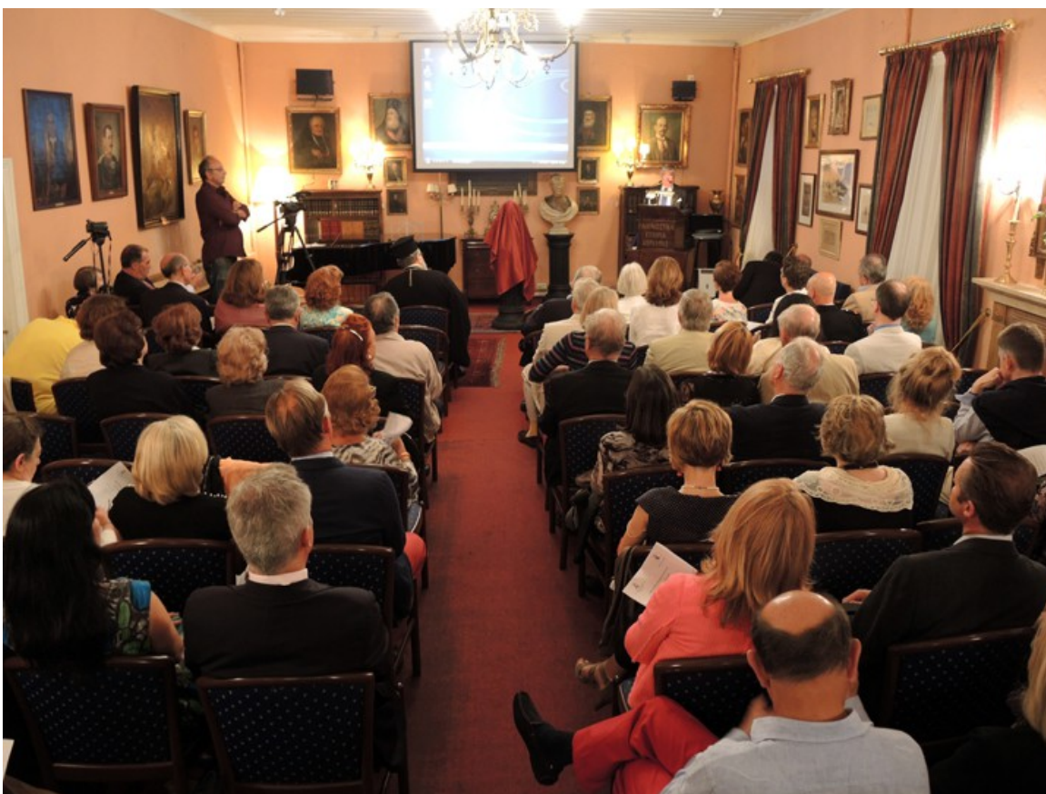
▲ The main lecture hall on the second floor of the Corfu Reading Society, 30 May 2014 ▼